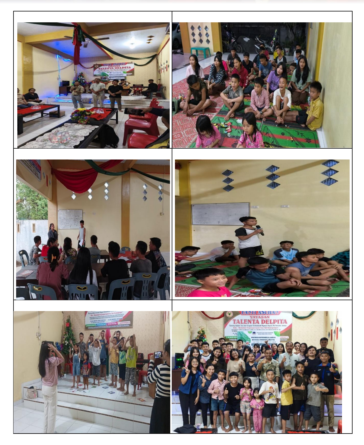
Figure . 1 English language learning at the Talenta Delpita orphanage with the Institution